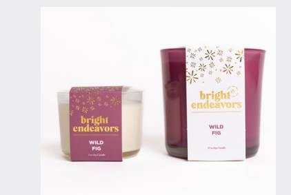
Wild Fig Fig, Leafy Greens, Black Currant, Lily, Amber