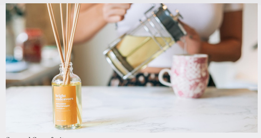
Sugared Grapefruit Sweet Citrus, Tropical Fruit