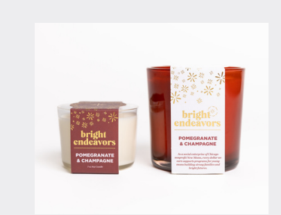
Pomegranate & Champagne Pomegranate, Citrus, Violet, Raspberry