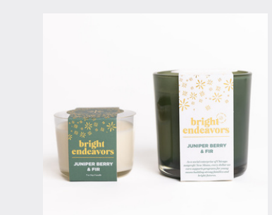
Juniper Berry & Fir Fir, Juniper Berry, Cedar,Jasmine, Vanilla