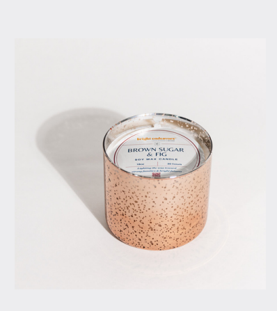
Brown Sugar Fig Fig, Caramelized Sugar, Sea Salt