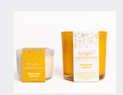
Heirloom Tomato Grapefruit, Tomato Vine, Leafy Greens