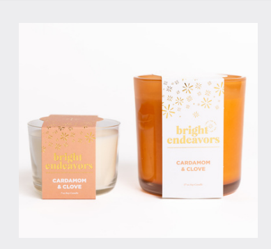
Cardamom & Clove Black Tea, Coconut, Ginger, Clove, Vanilla