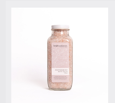
Peppermint Epsom salt, pink Himalayan sea salt, and peppermint essential oil.

Chamomile Epsom salt, pink Himalayan sea salt, dried chamomile flowers, and chamomile fragrance.