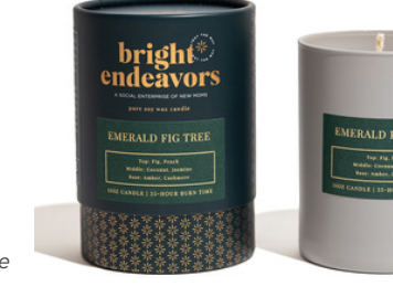
Emerald Fig Tree Top: Fig, Peach Middle: Coconut, Jasmine Base: Amber, Cashmere