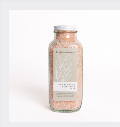
Eucalyptus Epsom salt, pink Himalayan sea salt, and eucalyptus essential oil.

Epsom salt, pink Himalayan sea salt, dried lavender flowers, and lavender essential oil.