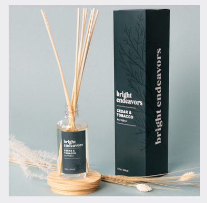
Cedar & Tobacco Anise, Clove, Cedar