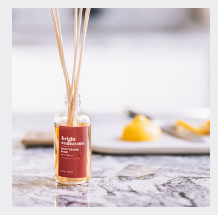
Whitebark Pine Pine, Sea Salt