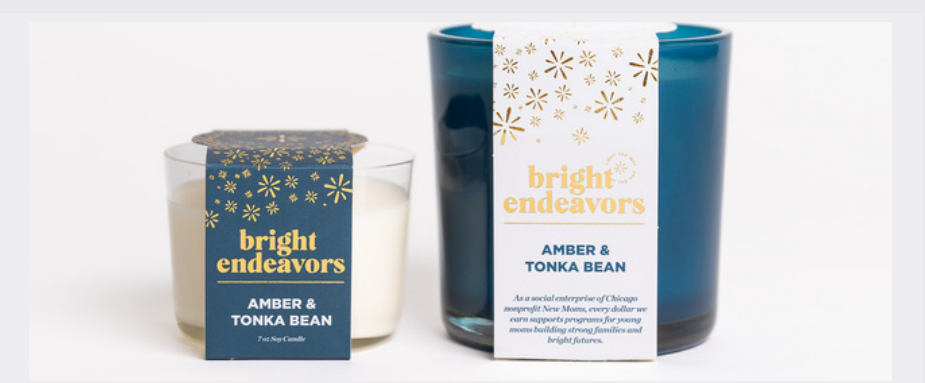
Amber & Tonka Bean Nutmeg, Plum, Rose, Amber, & Patchouli

17oz, 55 Hours, Case of 6, $90/MSRP $30 Mini Glass, 25 Hours, Case of 6, $48/MSRP $16