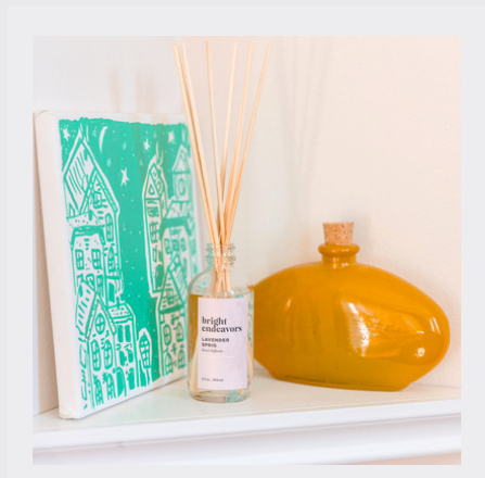
Lavender Sprig Lavender, Fresh Cut Grass