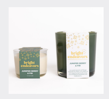
Juniper Berry & Fir Fir, Juniper Berry, Cedar, Jasmine, Vanilla