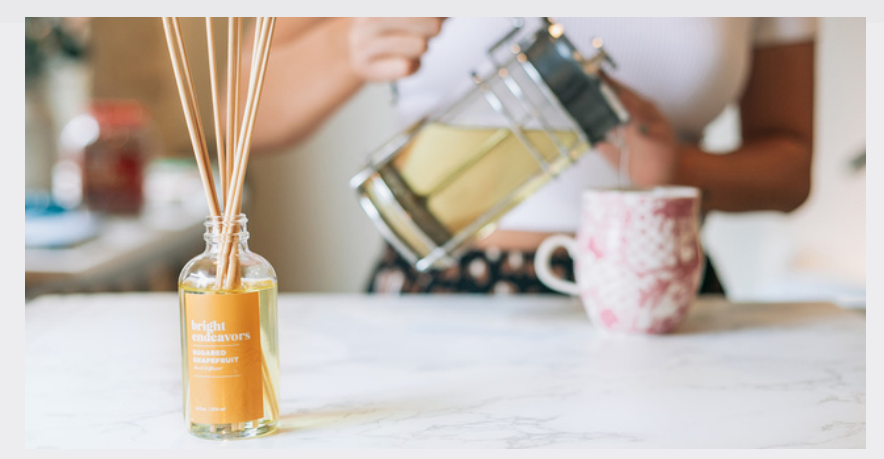
Sugared Grapefruit Sweet Citrus, Tropical Fruit