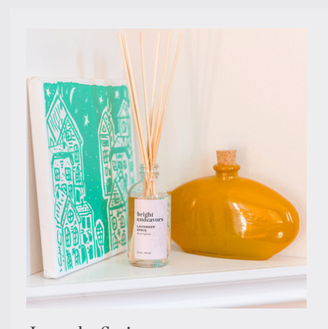
Lavender Sprig Lavender, Fresh Cut Grass