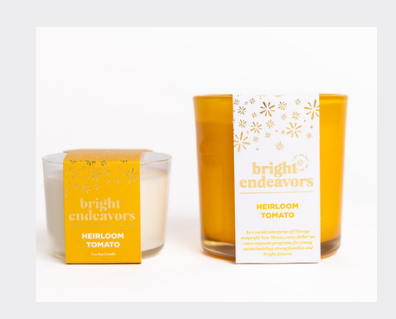
Heirloom Tomato Grapefruit, Tomato Vine, Leafy Greens