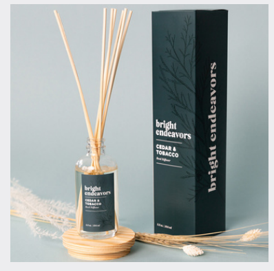
Cedar & Tobacco Anise, Clove, Cedar