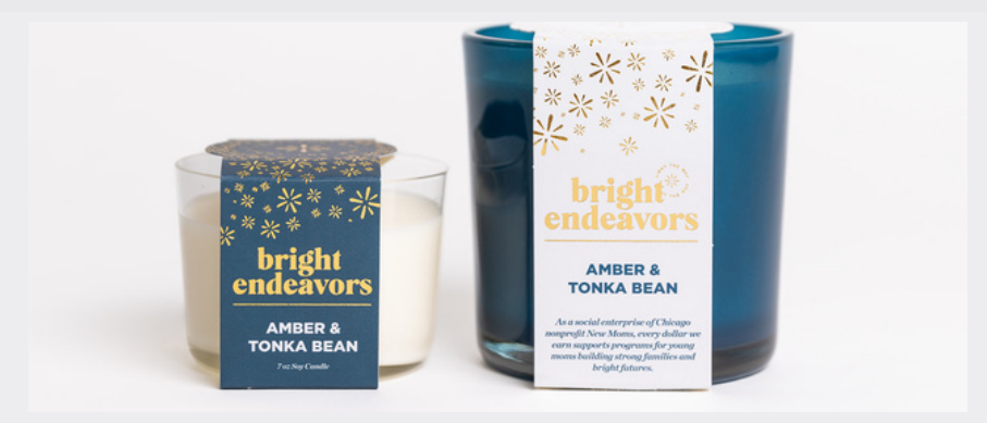
Amber & Tonka Bean Nutmeg, Plum, Rose, Amber, & Patchouli

170z, 55~Hours, Case~of~6, \$90/MSRP~\$30\\Mini~Glass, 25~Hours, Case~of~6, \$48/MSRP\\\$16