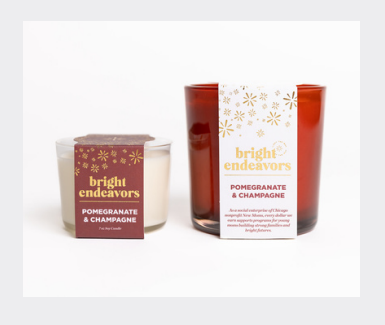
Pomegranate & Champagne Pomegranate, Citrus, Violet, Raspberry

Black Tea, Coconut, Ginger, Clove, Vanilla