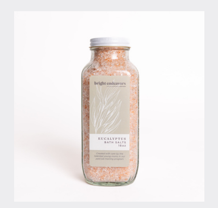
Eucalyptus Epsom salt, pink Himalayan sea salt, and eucalyptus essential oil.

Epsom salt, pink Himalayan sea salt, dried lavender flowers, and lavender essential oil.