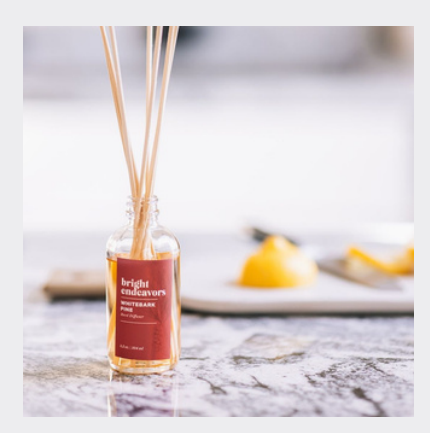
Whitebark Pine Pine, Sea Salt