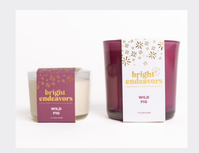
Wild\,Fig Fig, Leafy Greens, Black Currant, Lily, Amber