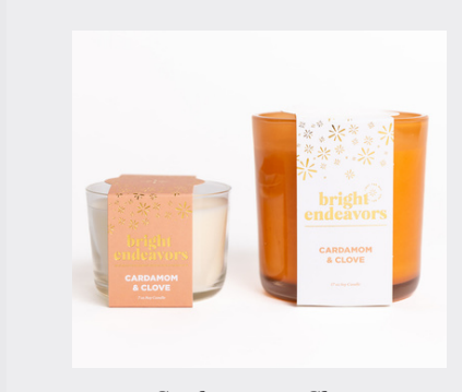
Cardamom & Clove

Black Tea, Coconut, Ginger, Clove, Vanilla